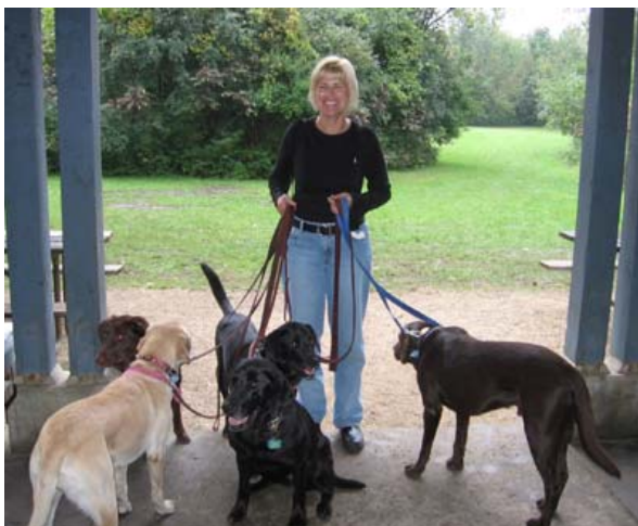
A "pack" of Labs hanging out at the Reunion

Overall we raised just over $5,000 dollars from the Reunion, including fundraising merchandise sales. Thanks to the generosity of everyone who attended, MLRR will be able to rescue and care for many Labs in the future.