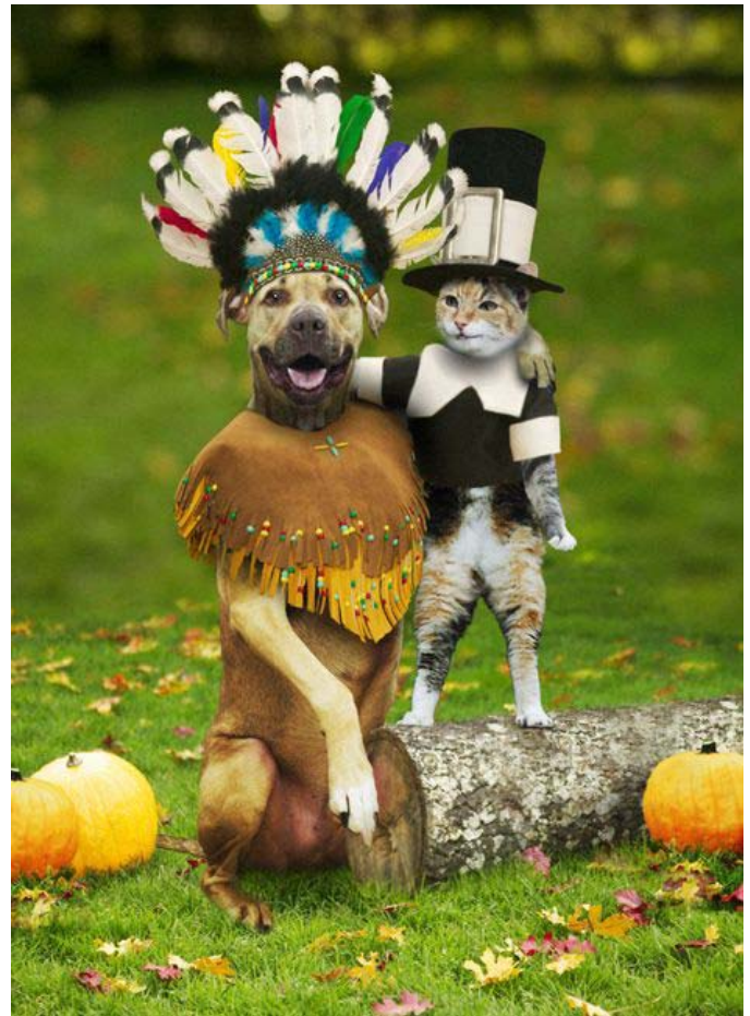
Happy Thanksgiving from Midwest Lab Rescue