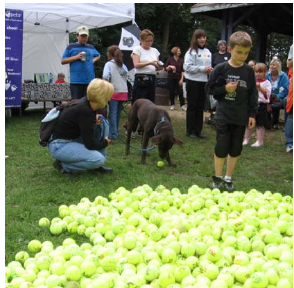
Rescued Lab Toby fetches the winning ball