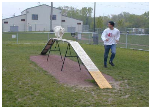
Pooch Park offers a small agility area

For more information visit www.skokieparkdistrict.org