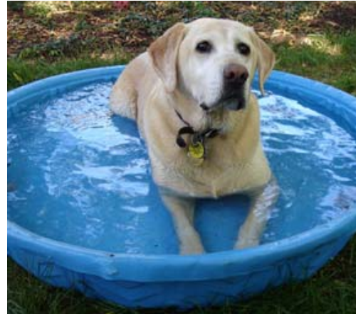
Princess Leia relaxing in her swimming pool.