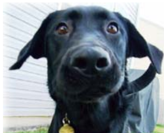
Doolittle a handsome black male looking for his forever home.