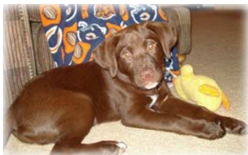
Robin looking for her forever home.