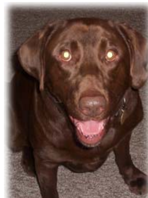
Hugo looking for his forever home