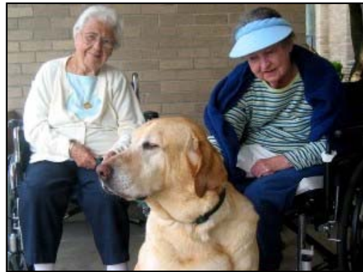
Dreyfus sitting with some of his extended family.