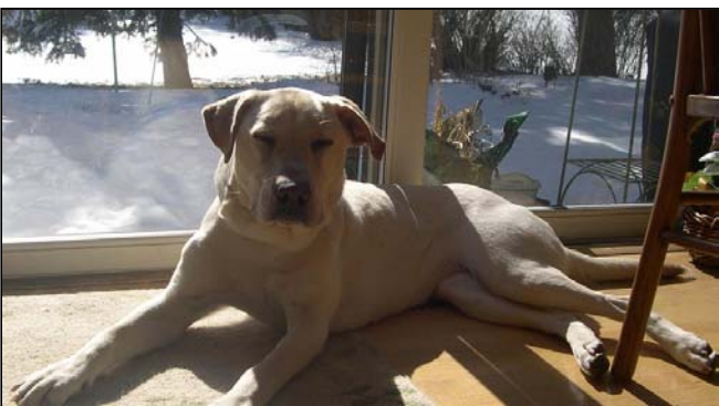
Bella relaxing in the winter sun

Phyllis wants everyone to know that some times rescued dogs do come with issues and it does take work, but they can be helped to overcome their fears and issues with patience and time.