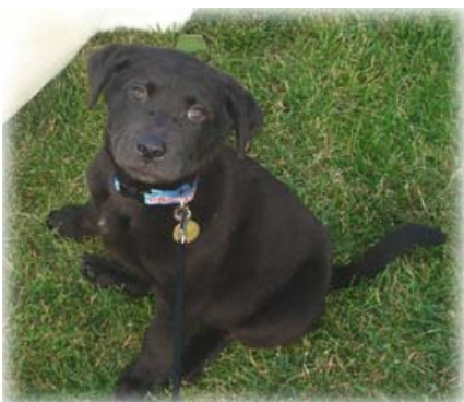
Clay a lucky puppy we were able to rescue because of generous donors.

Mark your calendars for next year's auction May 16 th , 2009 , at the Double Tree Guest Suites and Conference Center in Downers Grove. We are moving locations so we will have more space and plenty of room for friends and family to join us.