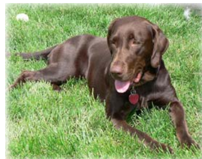
Kahlua "Lu" looking for a forever home